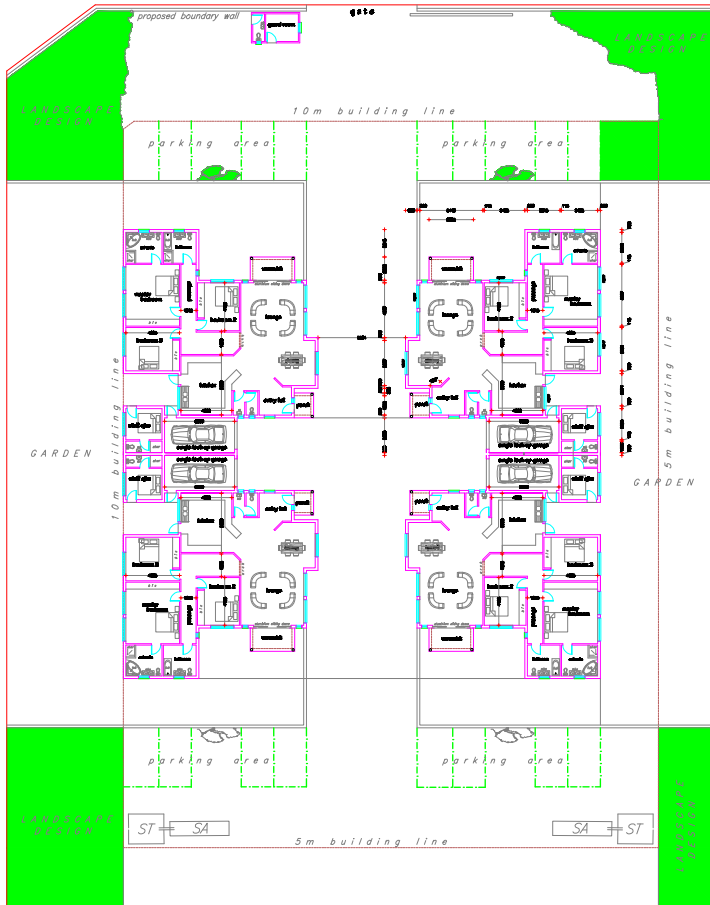
Site Floor Plan